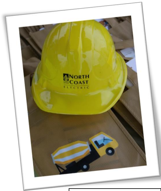
2018 Hard Hat Sponsor, North Coast Electric